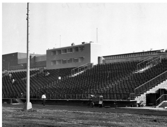
John D. Sulsberger Memorial Stadium on January 27, 1970.