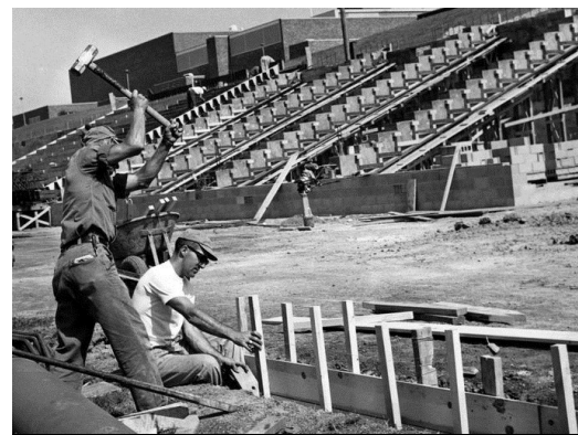
Construction workers work on John D. Sulsberger Memorial Stadium on August 16, 1964.