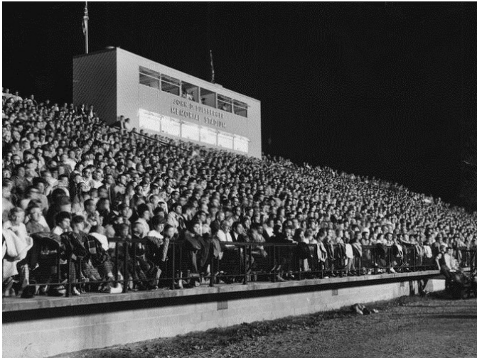
Standing room only at John D. Sulsberger Memorial Stadium on October 11, 1969.

"More than 8,000 fans — the largest crowd to see a football game here in many years — are expected to be on hand for the ceremonies and game."