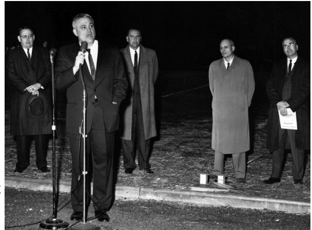
Ohio State football coach Woody Hayes speaks at the opening ceremonies for John D. Sulsberger Memorial Stadium on November 13, 1964.

After the dedication, the Blue Devils took on arch-rival Newark. Both teams entered the contest with 8-1 season marks and 3-1 Central Ohio League records. Newark won the contest by a score of 6-0.