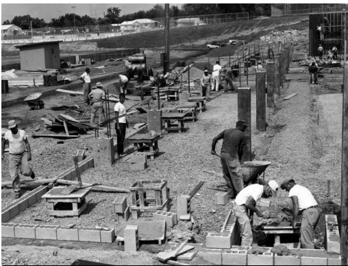
Workers lay the foundation for John D. Sulsberger Memorial Stadium on July 19, 1964.