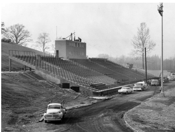
Sulsberger Memorial Stadium under construction on November 8, 1964.