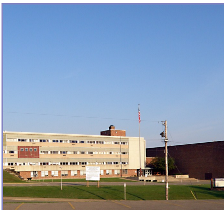
4th ZHS 1701 Blue Avenue Built 1953