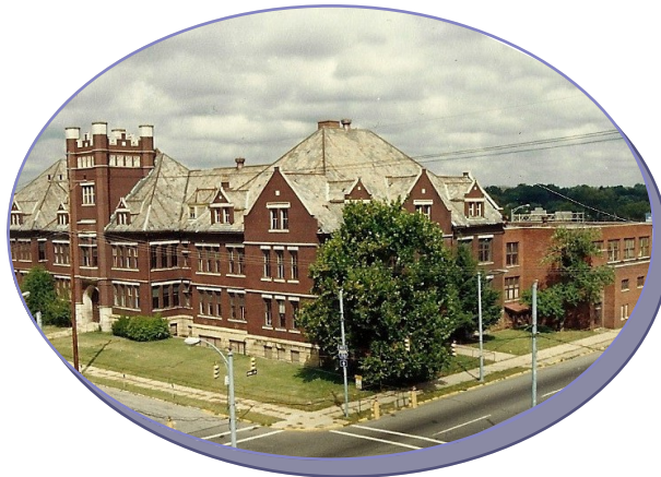
3rd ZHS (Lash High School) Built on North 6th Street Built 1908